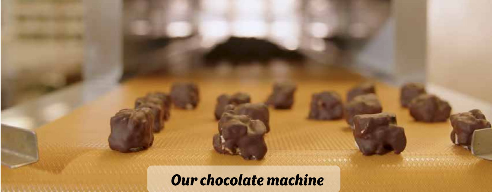
Our chocolate machine